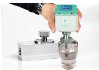
The sensor can be removed from the measuring section and cleaned.